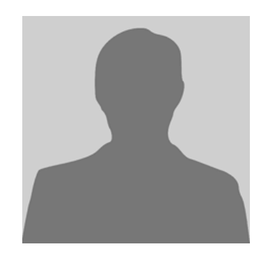
To Be Determined Sovereign Grand Inspector General in California, Ancient & Accepted Scottish Rite Southern Jurisdiction, U.S.A.